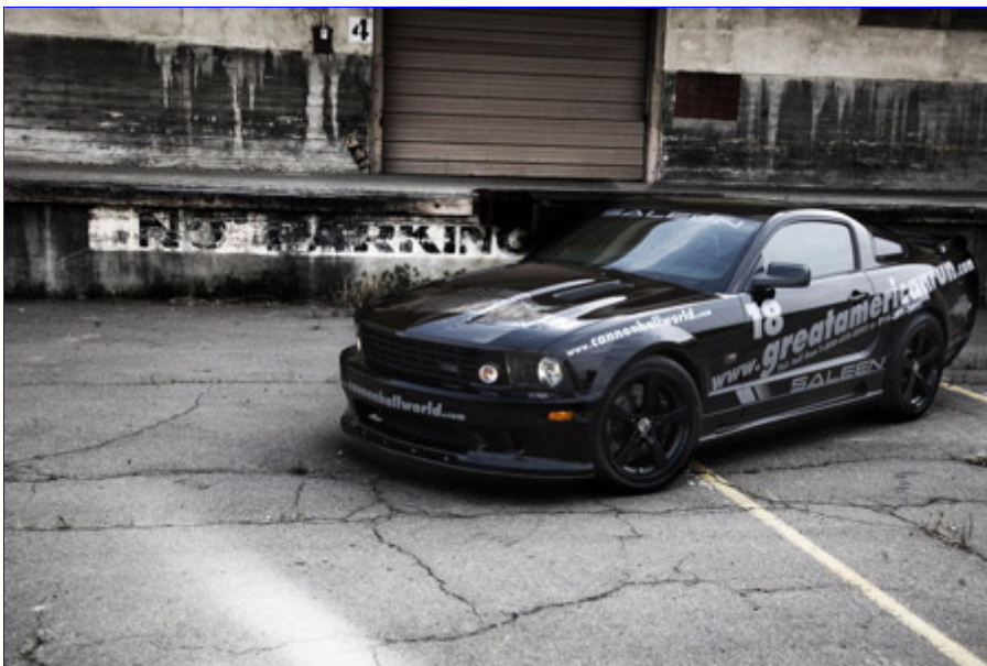
Two larger pics available by clicking image above

Saleen is on our radar again. While we enjoyed its new S331 Sport Truck , it's their Mustangs that we really like, particularly the Parnelli Jones Edition . So we were glad to hear about another new Mustang from this small manufacturer. This time it's a special version of the already unique S281 Extreme Mustang. A limited run of 25 "Ultimate Bad Boy Edition" Extremes has been built for use in the upcoming Cannonball Great American Run. We had a whiff of this particular vehicle a little while ago when a design concept brochure was somehow leaked onto the net. Now we have the details straight from the horse's mouth. As if the Extreme's 550 horsepower and 525 lb-ft of torque weren't enough, Saleen has found a way to extract an additional 50 hp from this motor, resulting in a nice round 600. The UBBE package includes the Extreme's Racecraft suspension, close-ratio six-speed transmission, 4:10 rear gearing with a Maxgrip differential, high-flow cooling system, 15" slotted and vented disc brake system, as well as unique black 5-spokes, special black-on-black paint, a gold dash plaque and the Cannonball decal package.